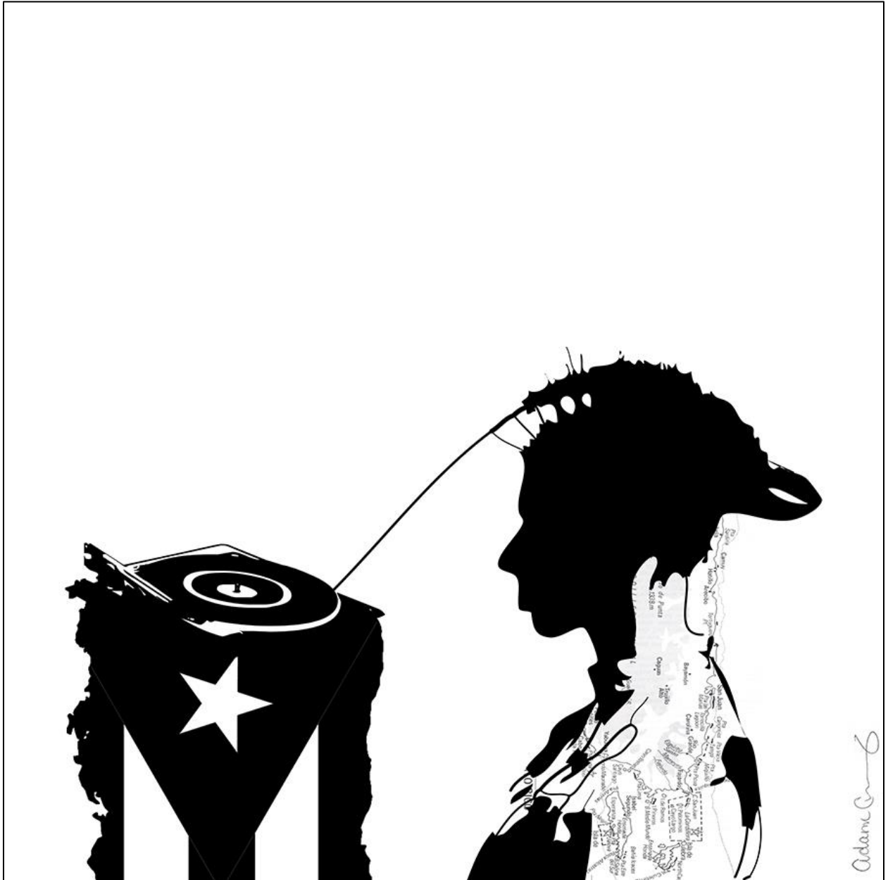
"Ocho" Black Ink 3 feet x 3 feet