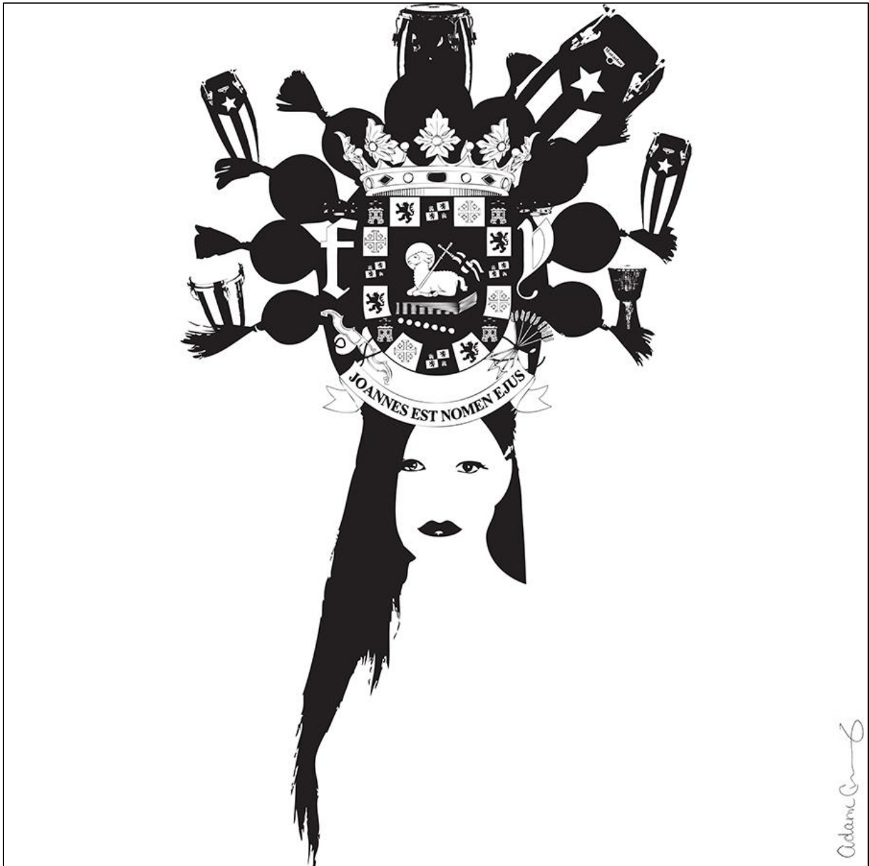
"Cinco" Black Ink 3 feet x 3 feet