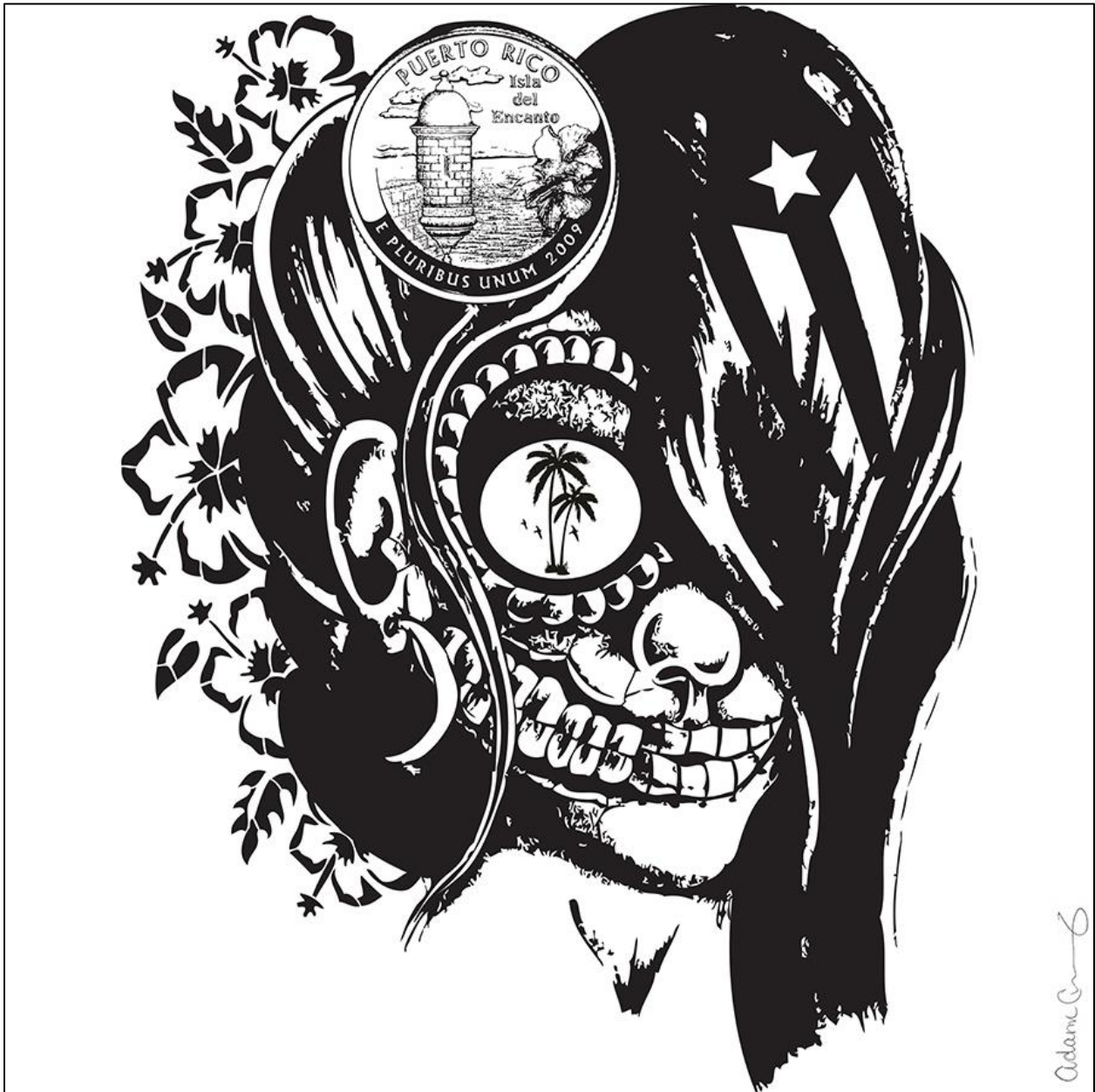
"Seis" Black Ink 3 feet x 3 feet