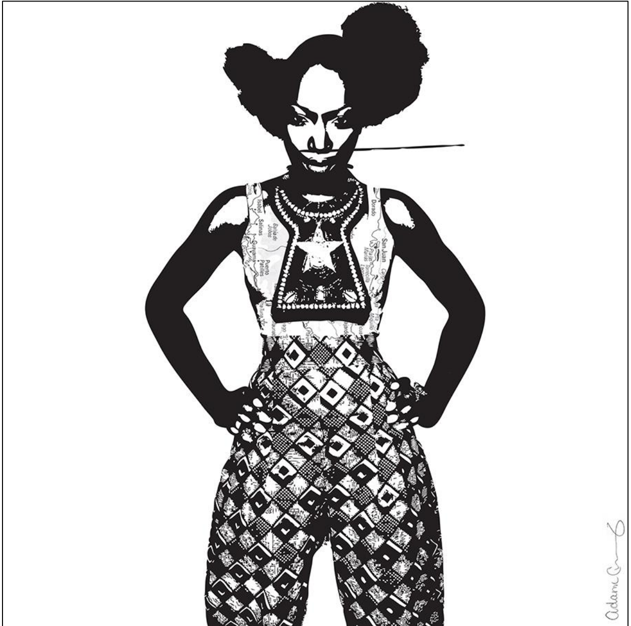
"Siete" Black Ink 3 feet x 3 feet