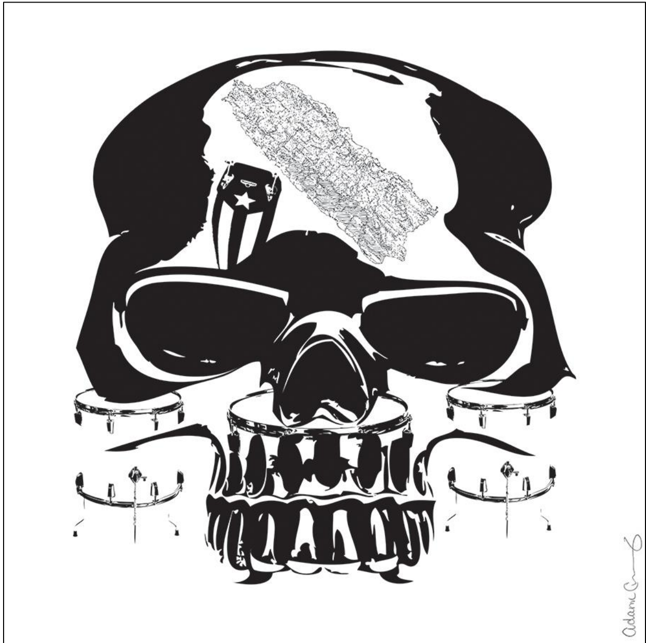
"Cuatro" Black Ink 3 feet x 3 feet