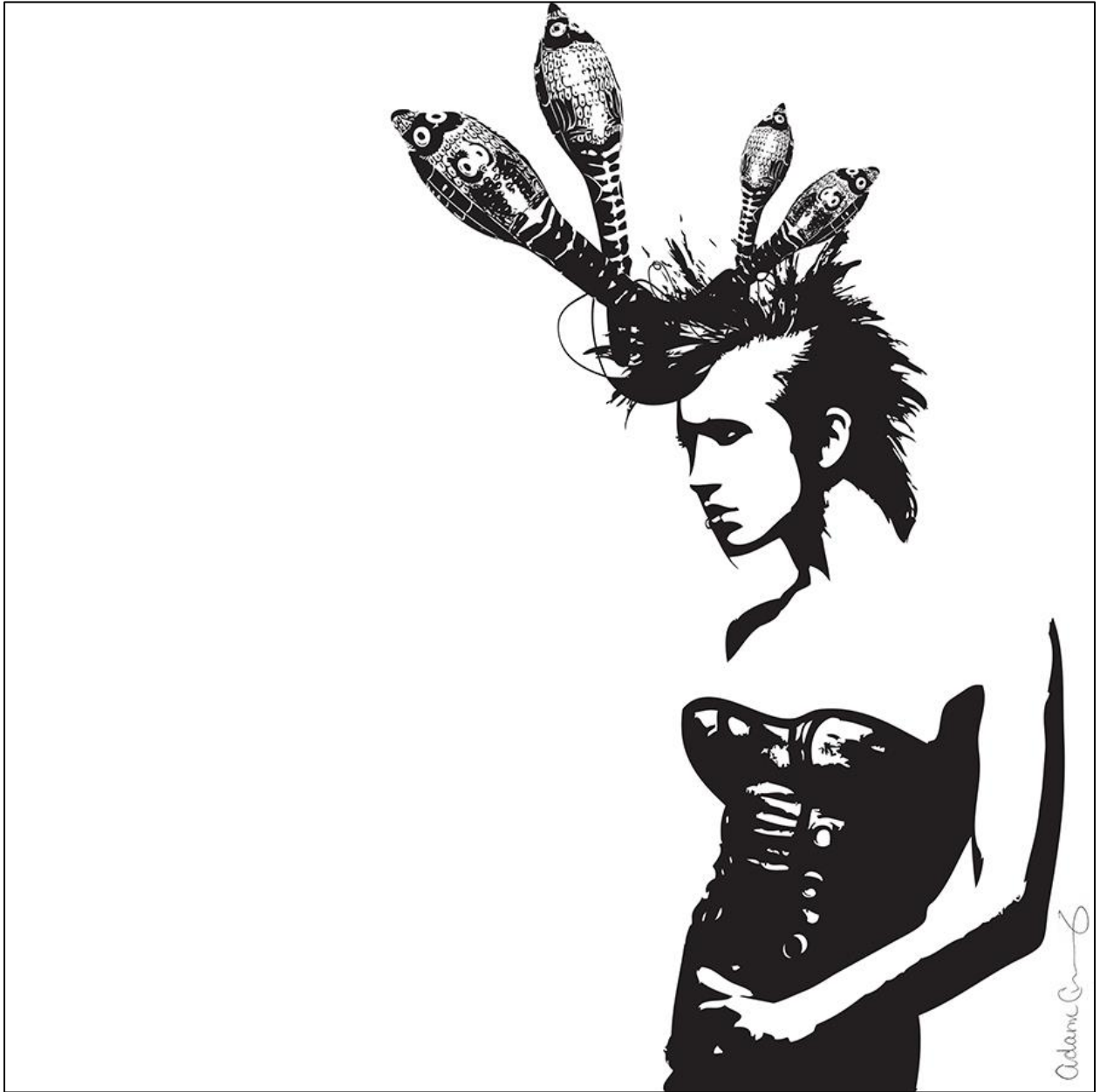
"Tres" Black Ink 3 feet x 3 feet