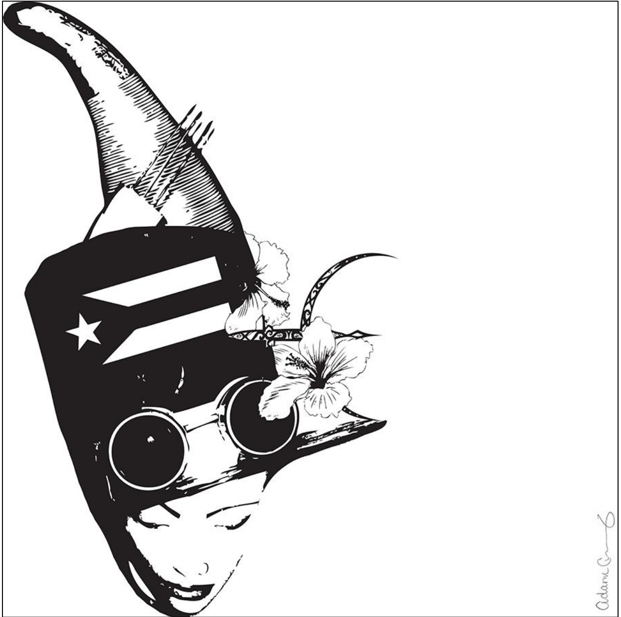
"Uno" Black Ink 3 feet x 3 feet