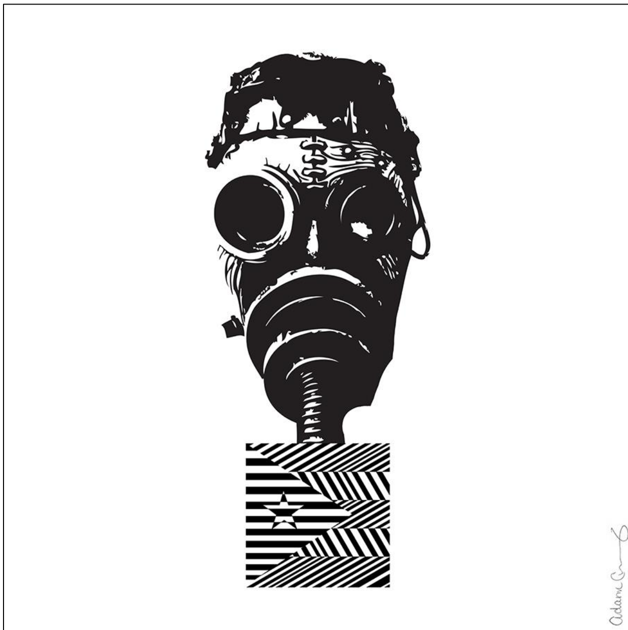
"Dos" Black Ink 3 feet x 3 feet